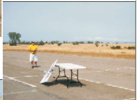
Who said it's easy?