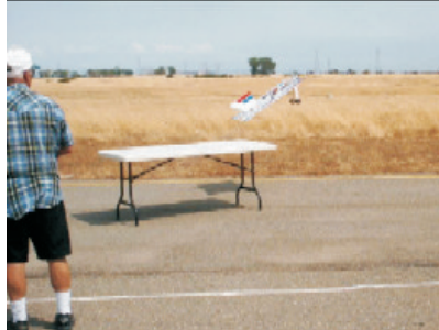
Touch'n go on the table.

Out of over 200 PBF sold only a couple showed up for fun fly. If may be explained by rough weather in the morning. But even so, the pilots, who flew their "flat piece of coroplast" had a great time.