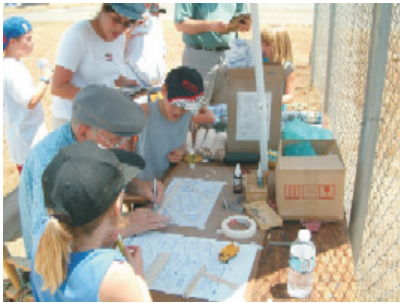
Some building skills are required.