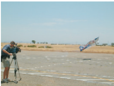
The show from the master.