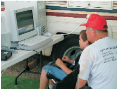
First some practice on RC flight simulator.

Thanks to the hard work of all people involved the event was a great success. We had good publicity in local TV news on channel 3 and channel 10, as well as an article in Folsom Section of Sacramento Bee.