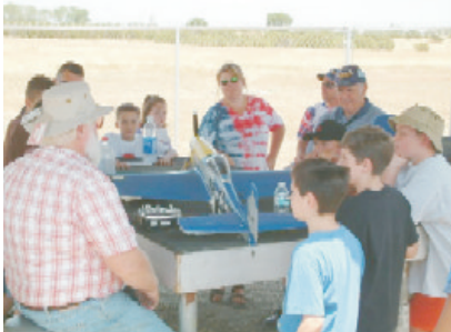
How stuff works?