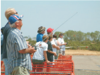
Next flying the real stuff.