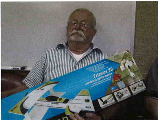
Les took home the Ultimate Arf