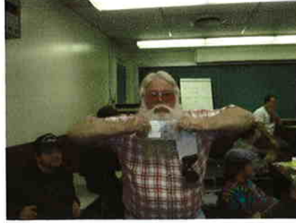
Dick scored a screw assortment