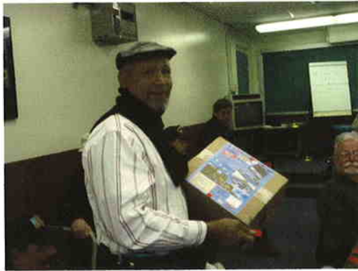
Romeo obtained the Aero fly Software