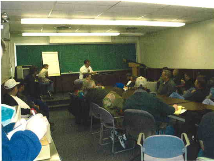
This Months Meeting Room

Members were encouraged to hurry up and renew their memberships for 2005. If you have been receiving this newsletter and have not renewed by the end of the month this will be your last issue. The club was contacted by the Sacramento Valley Soaring Society to inform us that they were trying to secure a large indoor flying site in Sacramento.