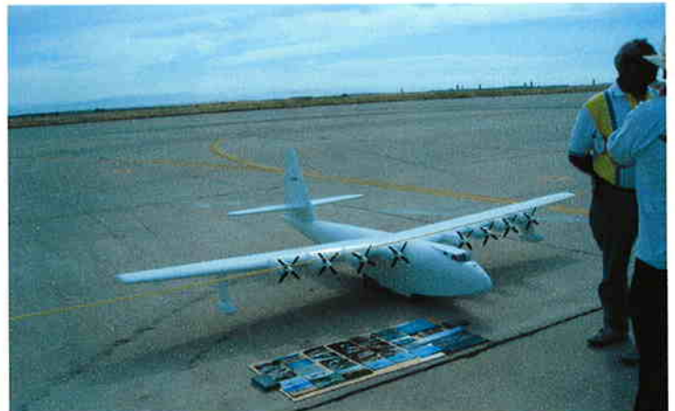
Two of Howard Hughes's beautiful creations