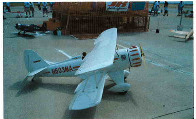
Gorgeous stagger winged biplane