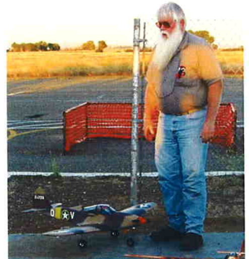
Dick's P-39, 0.39 engine on freq 39