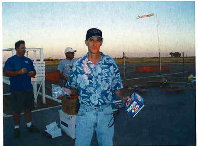
Scott wins 0.6 AR Magnum 4 stroke