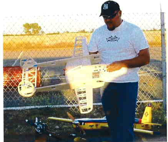
Pete's under construction P-38