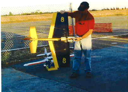
Mark's Tuflite 4D, EPR rubber and coroplast