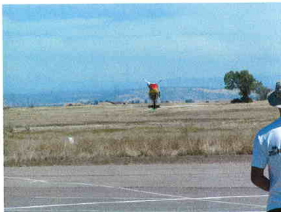
Helicopter demo for the crowd