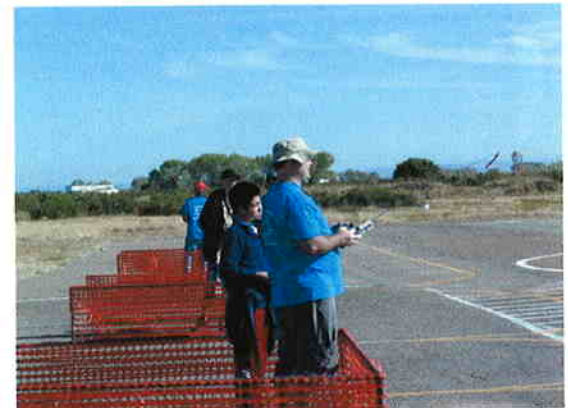
Dean in action