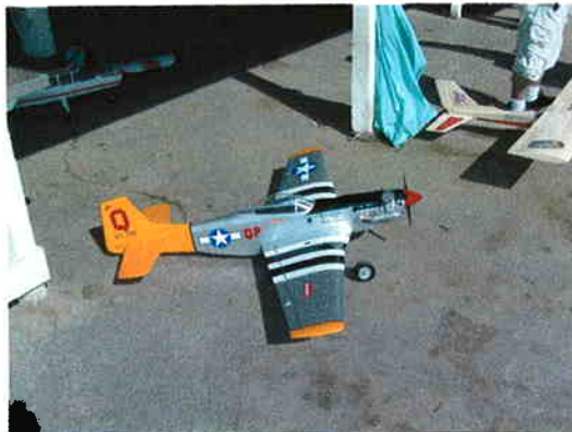
The plane the raffle winner will take home