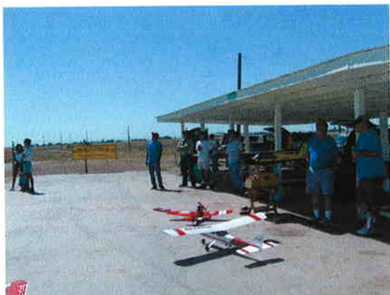
The crowd enjoys the helicopter demo