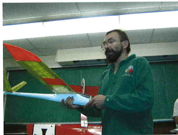
Next was his Thunder Tiger glider