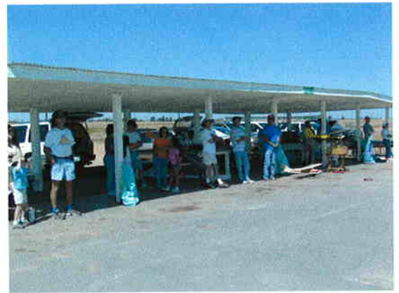
The public awaits their turn