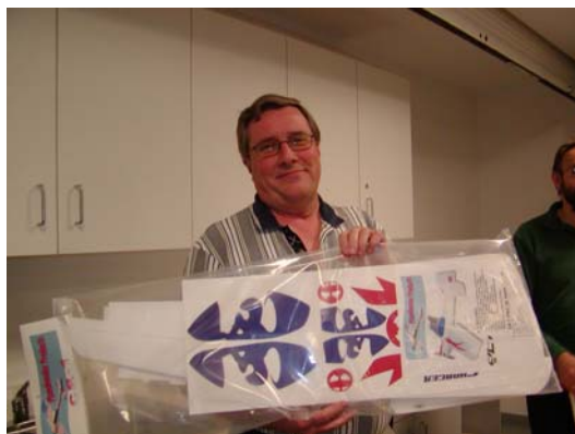
Hank scored the Planebender foamy