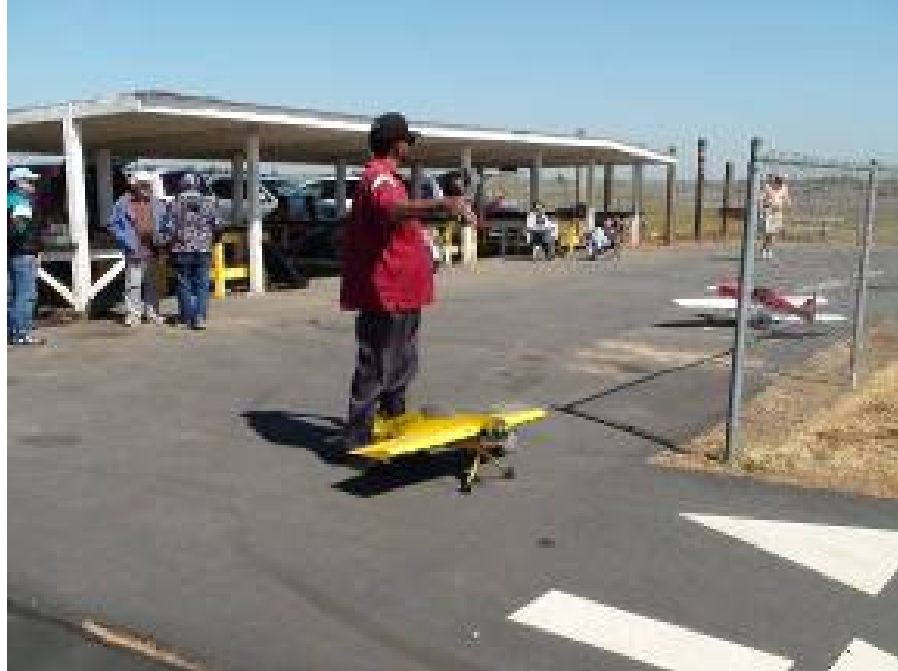
Rex asking for directions to the flight line.