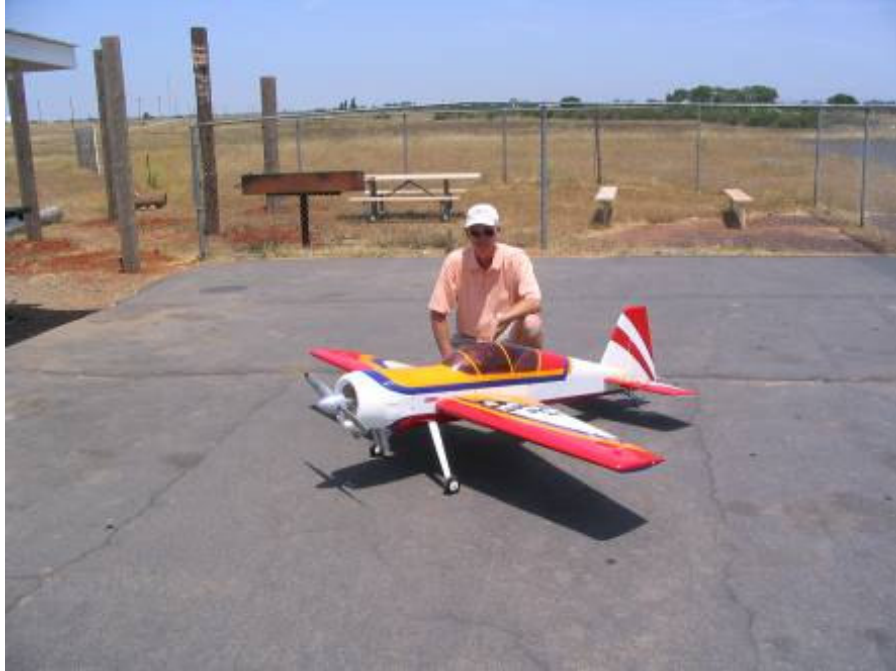
New AeroWorks 75 cc Yak ready for the first flight.