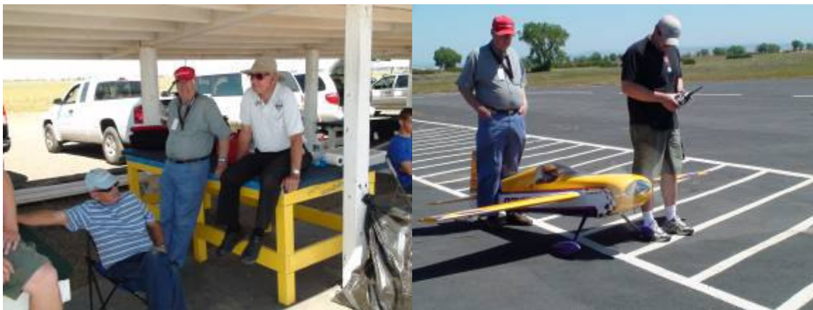
Our friendly courteous staff is always here to help you.....