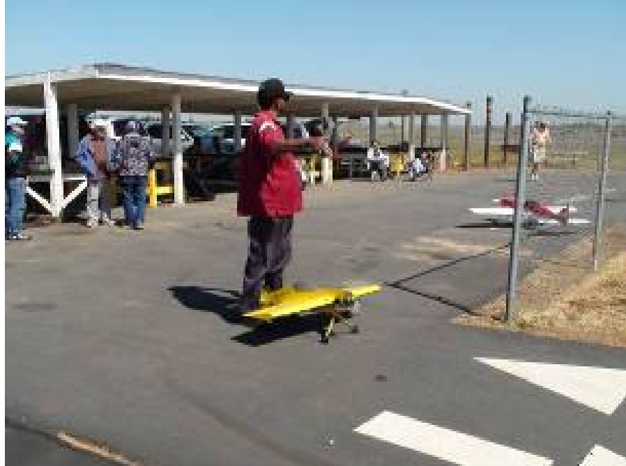
Rex asking for directions to the flight line.