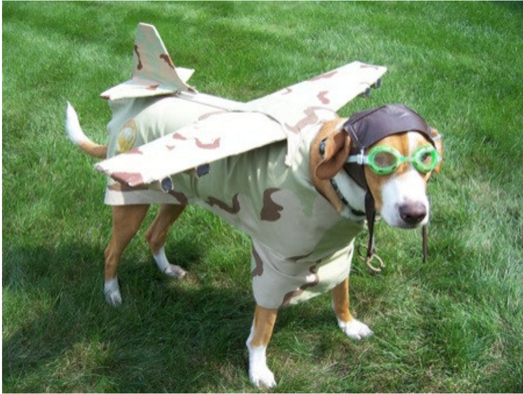
The new security guard for the field.