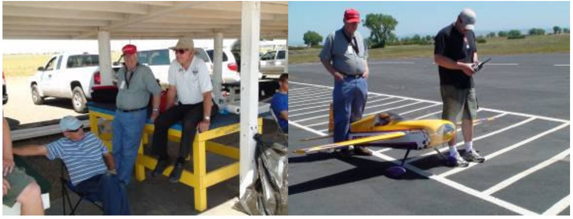
Our friendly courteous staff is always here to help you......