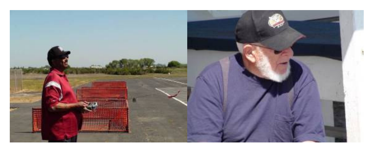
The Tuesday morning group gets a few early flights.