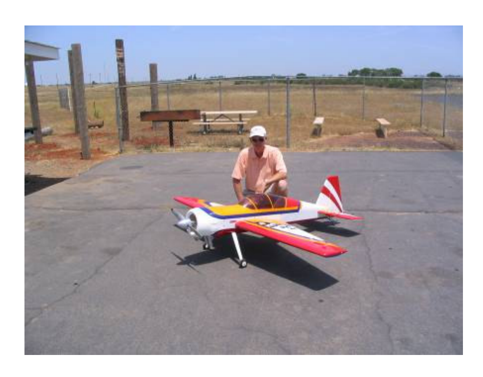
New AeroWorks 75 cc Yak ready for the first flight.