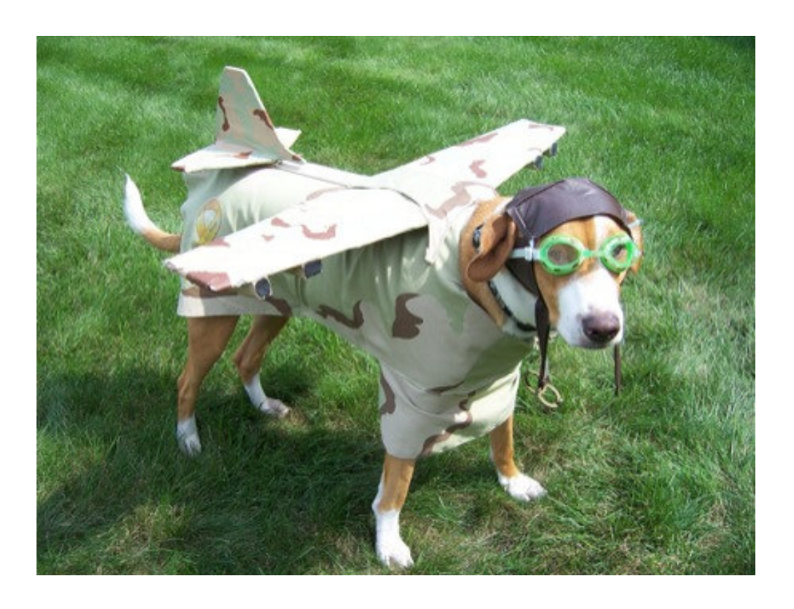
The new security guard for the field.